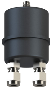
1/4" Compression Fittings