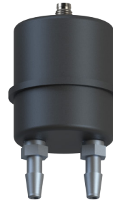
Barbed Fittings for 1/4" Tubing