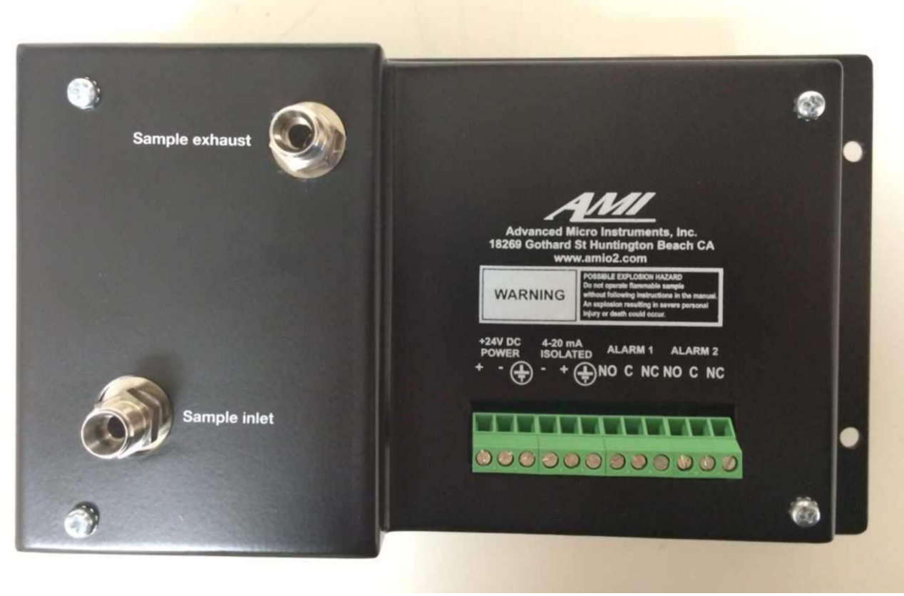
Figure 1. Back panel of 2001LC analyzer