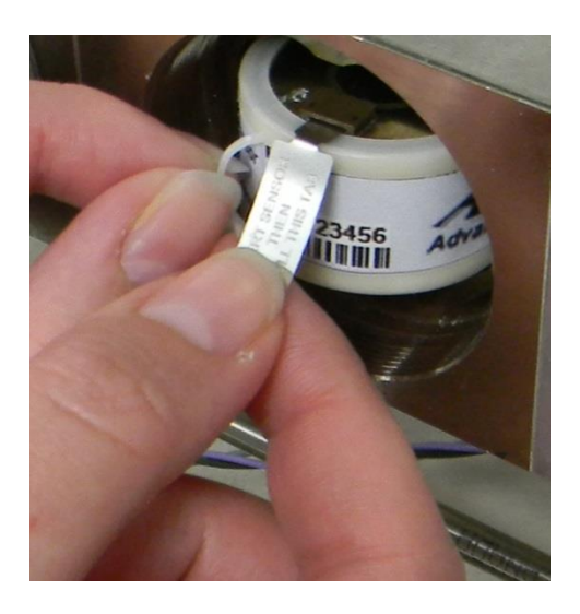
Figure 5. Inserting sensor in cell block

Dispose of leaking or used sensors in accordance with local regulations. Sensors usually contain lead which is toxic, and should generally not be thrown into ordinary trash. Refer to the MSDS to learn about potential hazards and corrective actions in case of any accident.