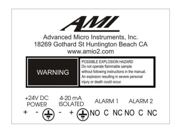
Figure 3. Back panel screen print of the 2001LCS.