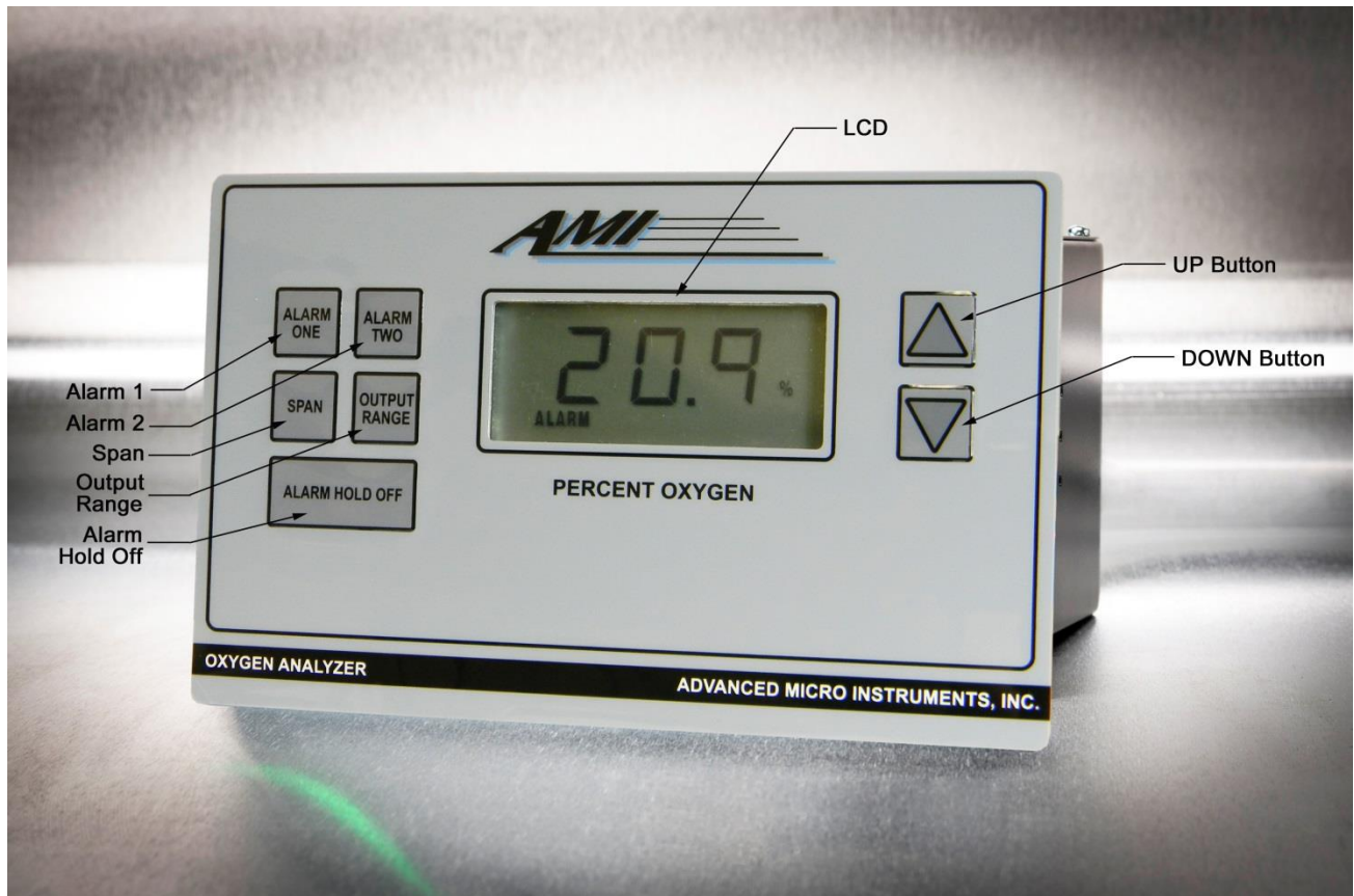
Figure 2. The 70R1

Since this analyzer does not contain a replaceable sensor, only electronic controls are visible on the front panel.