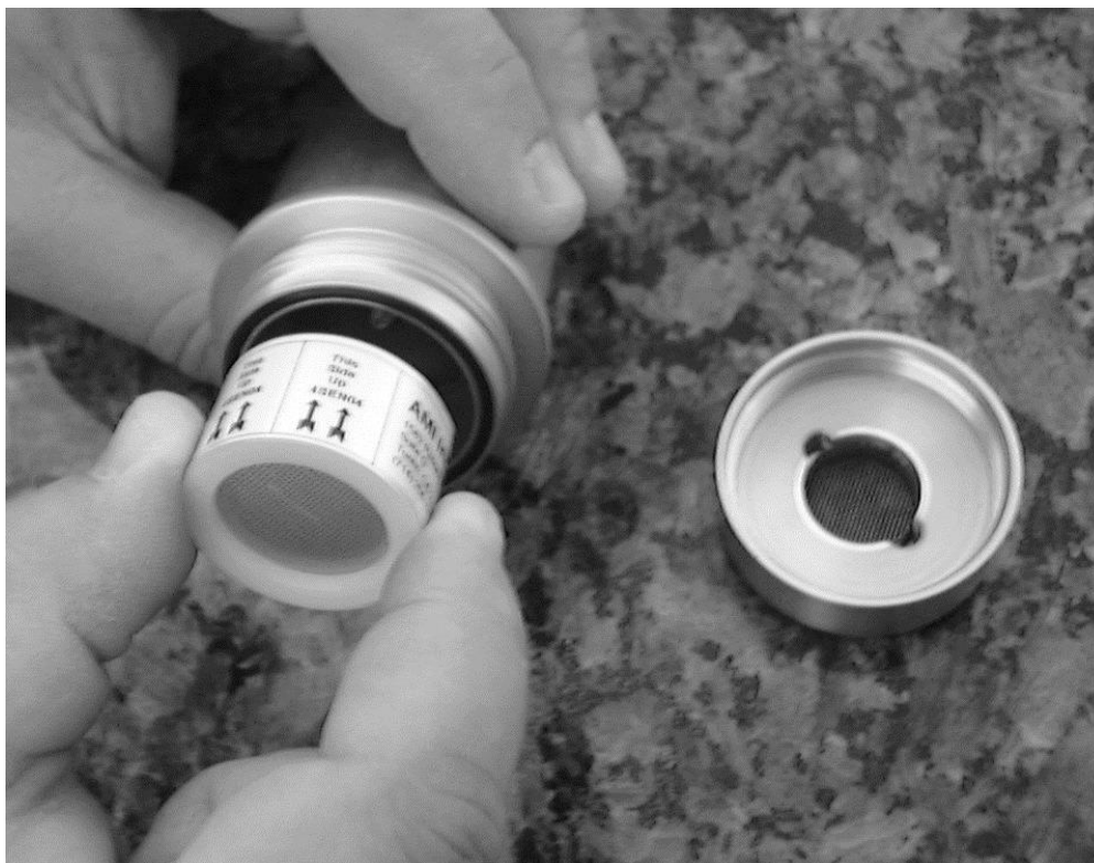
Figure 4. Inserting sensor in probe

Dispose of leaking or used sensors in accordance with local regulations. Sensors usually contain lead which is toxic, and should generally not be thrown into ordinary trash. Refer to the MSDS to learn about potential hazards and corrective actions in case of any accident.