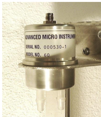
Figure 1. Probe showing preferred mounting

If the display unit is used, connect it to a suitable power supply (12 –24V DC), and connect the output if desired to a suitable monitoring system.